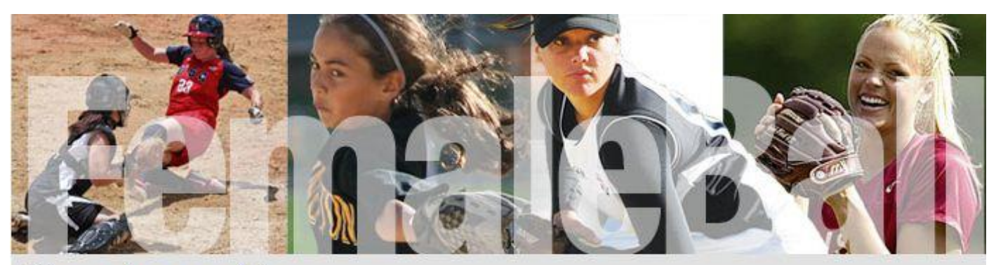
Diamonds are our thing...

Please find further details of each of the above initiatives in the following pages.